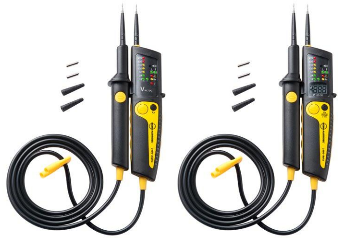
2100-Alpha DUAL RATED CAT III 690V CAT IV 600V

The Beha-Amprobe 2100-Alpha, 2100-Beta and 2100-Gamma are rugged and reliable two pole voltage testers for voltage and continuity checks. Built tough for use in industrial and commercial environments, the 2100 Series is safety rated up to CAT III 1000 V / CAT IV 600 V and measures voltage range up to 1000 V AC and 1200 V DC (2100-Gamma only). Designed with reinforced components for dependable performance, the 2100 Series has an ingress protection degree of IP 64 and is built according to voltage tester standard EN 61243-3:2014 and is GS approved.